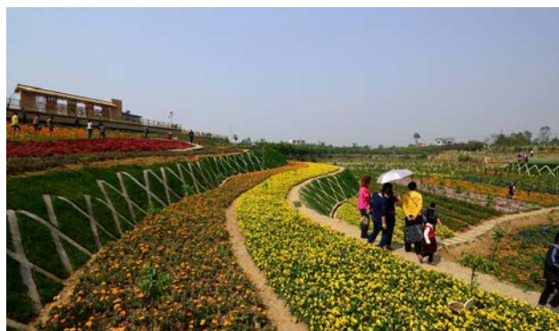
Figure 3 Rural extension construction

In order to promote the development of rural tourism culture, it is necessary to promote the formation of new tourism culture industry and develop tourism culture products actively. For example, we can develop sightseeing agriculture (as shown in figure 3) to advance on the basis of beautiful rural construction. Furthermore, innovation in cultural products needs to be strengthened and different products should be developed for different audiences. For the elderly, health products should be the first priority; for young people, learning and recreation products should be the main focus [5]. However, in the development of products should fully combine the local cultural characteristics, so that the developed products can not only meet the needs of people, but also promote the local culture, and then promote the income of local residents, promote the formation of new industries, and promote the development of tourism culture.